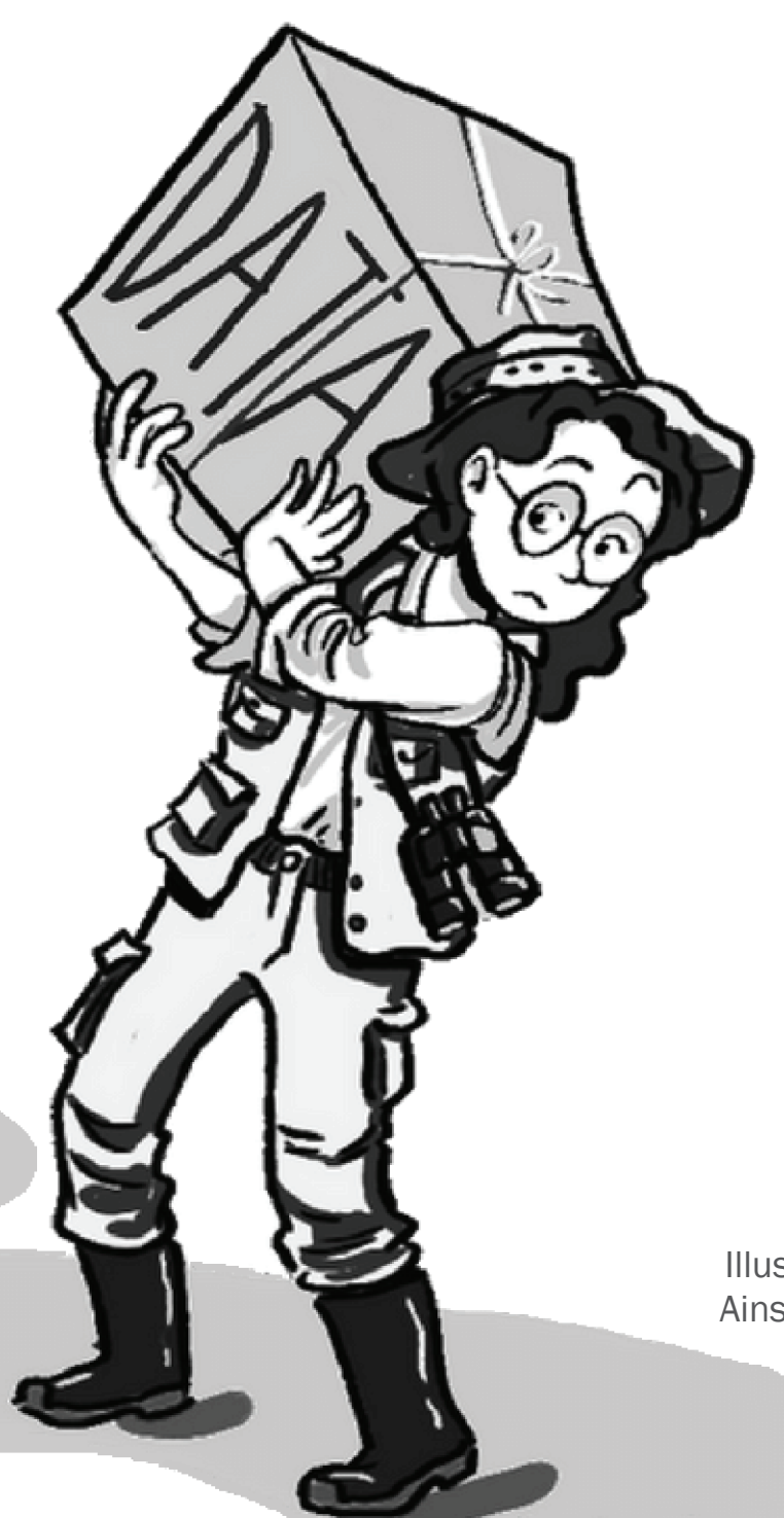
Illustration by Ainsley Seago

https://doi.org/10.1371/journal.pbio.1001779.g001